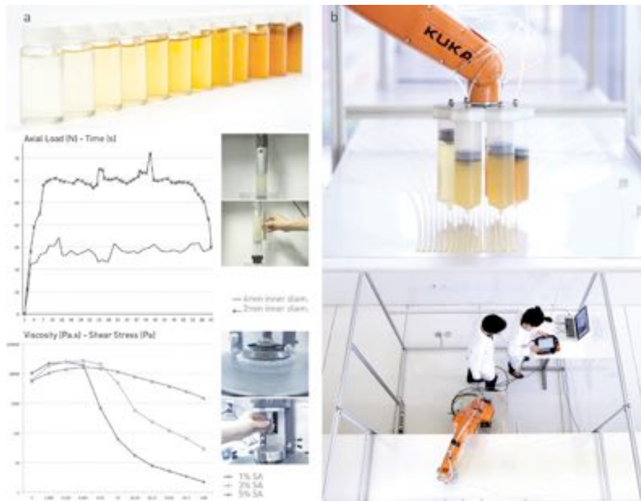
Figure 2: (a) Hydrogel material gradients vary from 1% to 12% concentration of biopolymer in water. Material characterizations such as axial load and shear rate are used to inform hardware design and software implementation. (b) The hardware platform is composed of a custom multi-barrel deposition system and a positioning robotic arm.

Hardware: The pneumatic assembly is designed to additively fabricate large-scale structures made of water-based materials. It is composed of six large-capacity clear plastic barrels containing hydrogels of different viscosities and is attached to the end-effector of an existing 6-axis robotic arm, connected to a positive and negative air pressure system. Both pneumatic assembly and robotic arm are digitally controlled to tune pressure and speed on-the-fly based on desired extrusion geometries and material properties ( Figure 2b ).