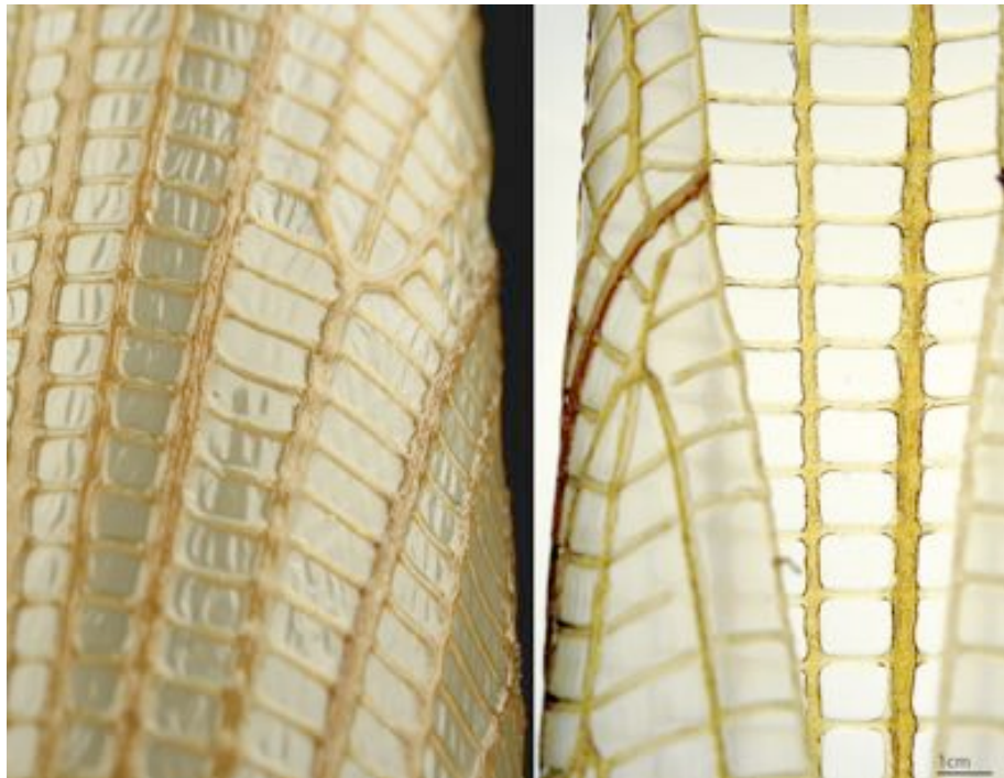
Figure 1: Close-up back and front images of a 3m-long hierarchically structured bio-plastic column form fabricated using a material-driven computational workflow integrating digital design with a novel robotic additive manufacturing platform.